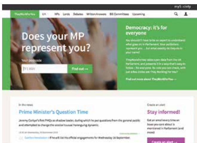
Figure 9: Screenshot of front page of TheyWorkForYou.com.

TheyWorkForYou.com provides accessible, searchable data on the members and proceedings of Parliament , the main legislative body of the United Kingdom, as well as the Northern Ireland Assembly . Previous versions of the website also offered information on the members and proceedings of the Scottish Parliament . TheyWorkForYou.com provides a wide range of information, including members' voting records, speeches, and registered interests. The front page of the website invites users to answer the question "Does Your MP represent you?" by filling in their postcode to access analysis on the way their constituency's MP votes and see their latest appearances in Parliament (See Figure 9 and Figure 10).