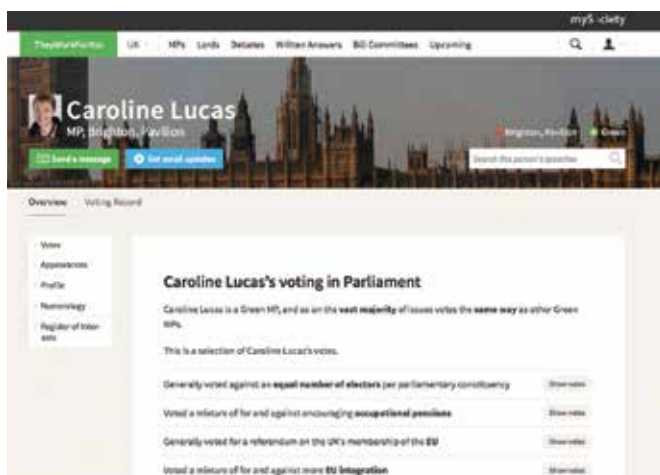
Figure 10: Screenshot from TheyWorkForYou.com. Copyright mySociety. Reproduced with permission.

TheyWorkForYou.com was launched in June 2004 by a group of volunteers "who thought it should be really easy for people to keep tabs on their elected MPs , and their unelected Peers, and comment on what goes on in Parliament " 174 . Individually, the original volunteers had already developed a number of